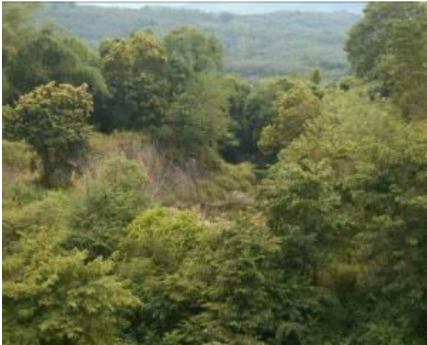
Fig.1 View of Muniyattukunnu