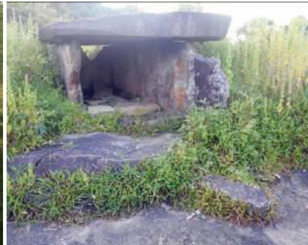
Fig.2 View of Muniyara in Muniyattukunnu